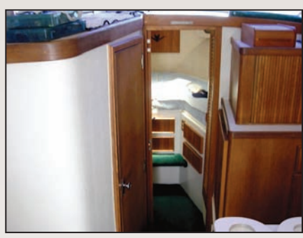
A surprisingly large and well-equipped interior for this size boat.