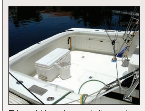
This model has a large cockpit, a must for fishing and cruising in Florida, where boaters spend most of their time outside.

managed to get through it all unscathed and tied up in our slip, right next to a submerged 40' (12m) Carver.